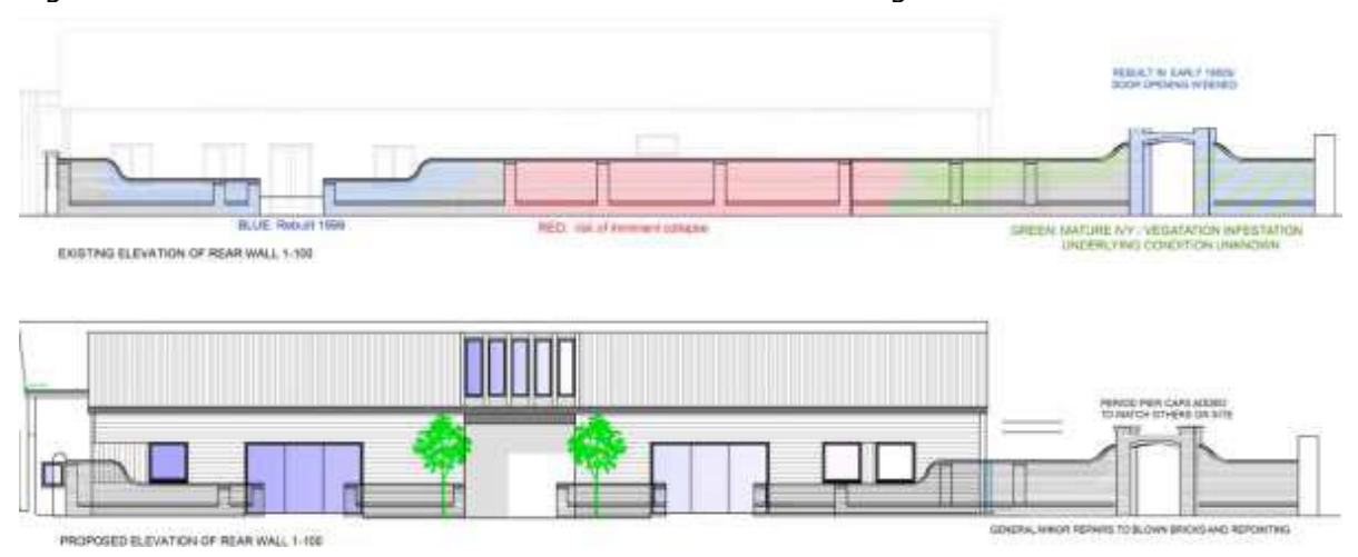
Figure 2 Works to the wall at the rear of the studio building

to a height of 1.2 metres that was previously granted consent. Listed building consent for partial reduction in height of garden wall and formation of new gateway, granted on the 16 August 1999 under reference 99/1078.